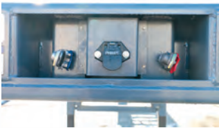
Ease of access & repair of 7-way harness and gladhands