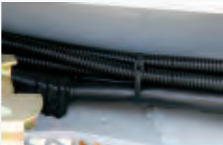
Air and electrical lines protected with automotive wire loom for optimal wire protection