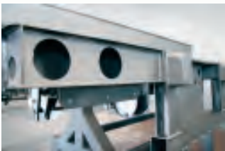
All steel parts are shot-blasted and coated with zinc epoxy primer, before fabrication and after welding