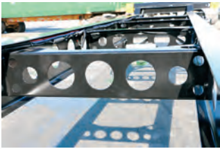
Lightweight durable construction with tare weight 5,450 lbs