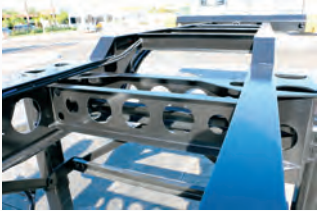
Extra cargo capacity