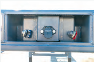
Ease of access & repair of 7-way harness and gladhands